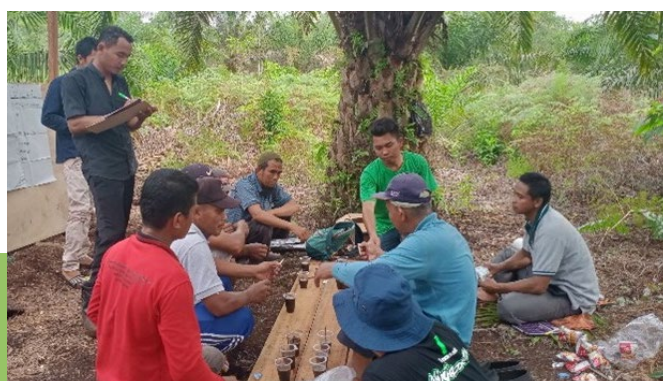
Figure 1 Farmers receiving training on Good Agricultural Practices for oil palm production in Mengkapan village in Siak.

It is believed that through this approach community livelihoods become more resilient, e.g. to economic or climate crises; it supports communities in mutually agreeing and achieving their development potential.